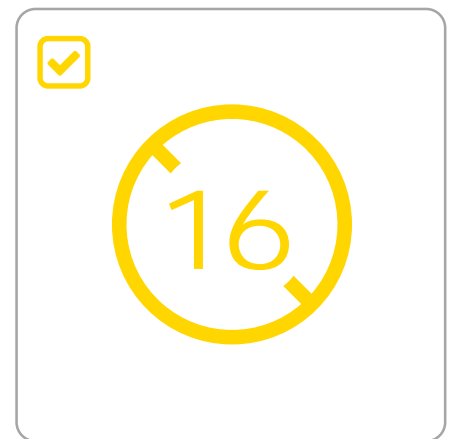
Over the age of 16