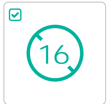
Over the age of 16