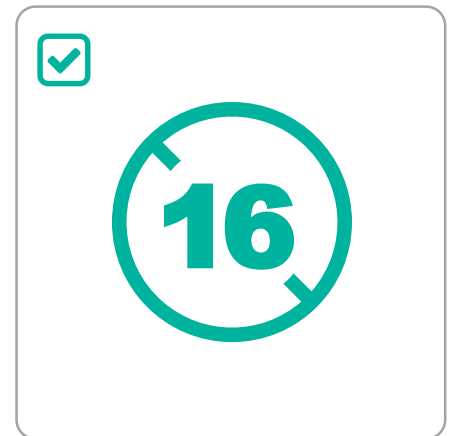
Over the age of 16