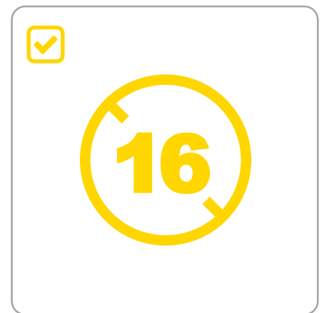
Over the age of 16